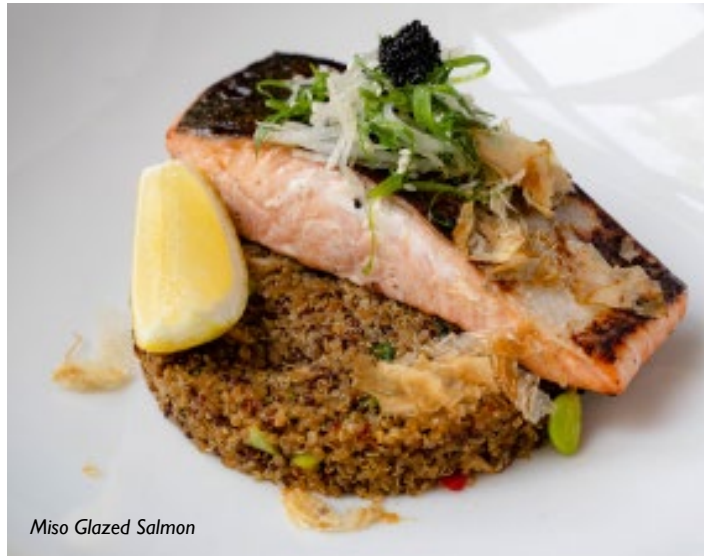
Miso Glazed Salmon