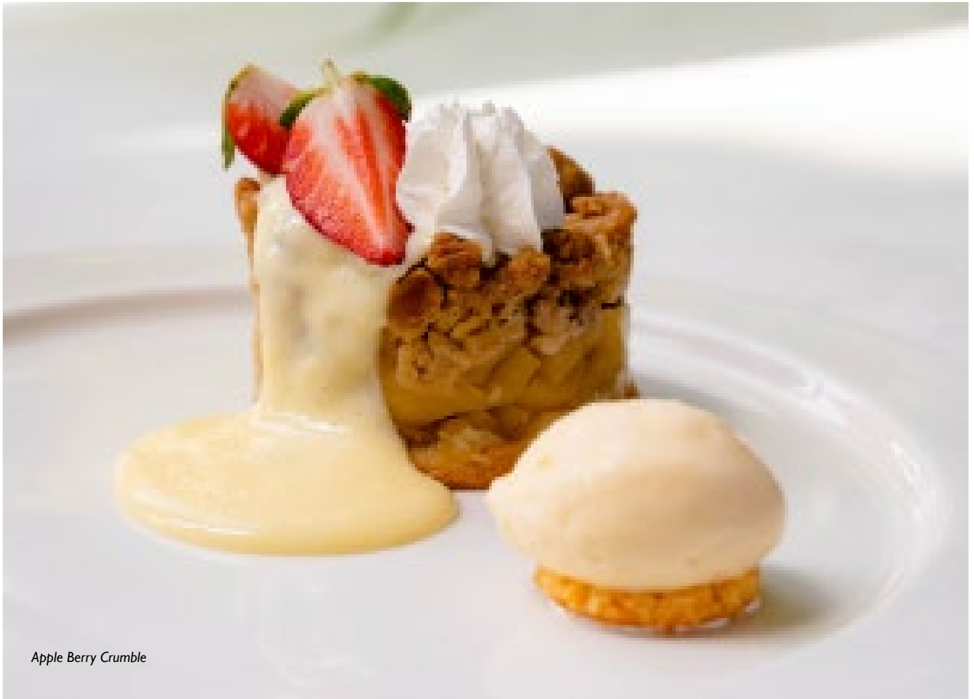
Apple Berry Crumble