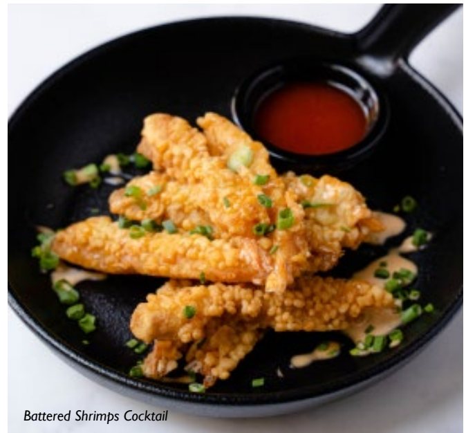
Battered Shrimps Cocktail

Hickory's Mix Party Platter S N D G 140 4 Each of buffalo chicken wings, spring rolls, breaded shrimps, mozzarella, sticks, fried calamari, cheese nachos, served with lemon garlic mayo & sweet chili sauce CL 1231