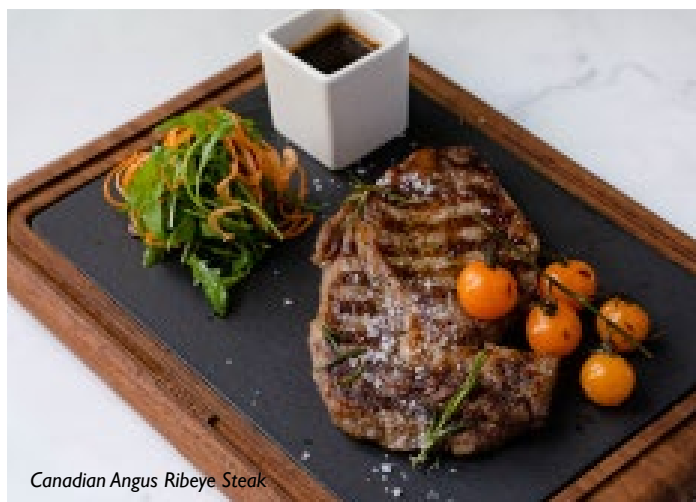
Canadian Angus Ribeye Steak