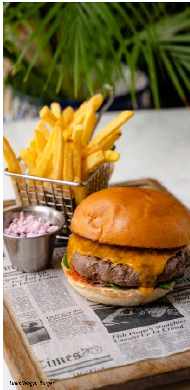
Links Wagyu Burger

N – Nuts V – Vegetarian GF – Gluten Free G – Gluten D – Dairy E – Eggs SD - Sulphates SO – Soy Beans S – Fish and or Shellfish P - Peanut SE - Sesame M - Mustard C - Celery