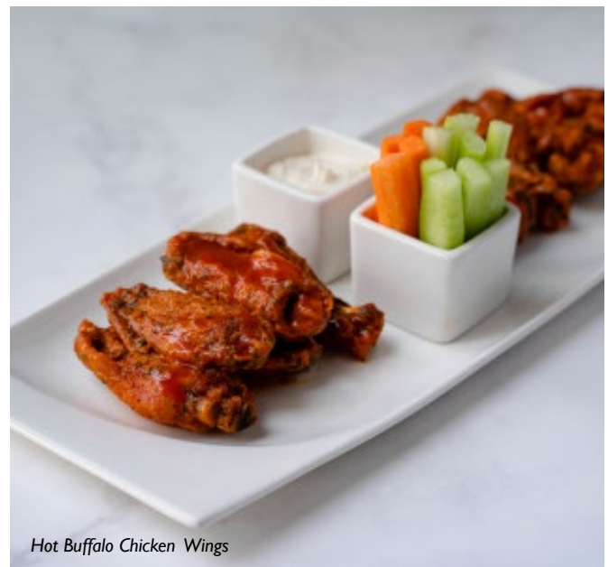
Hot Buffalo Chicken Wings

N – Nuts V – Vegetarian GF – Gluten Free G – Gluten D – Dairy E – Eggs SD - Sulphates SO – Soy Beans S – Fish and or Shellfish P - Peanut SE - Sesame M - Mustard C - Celery