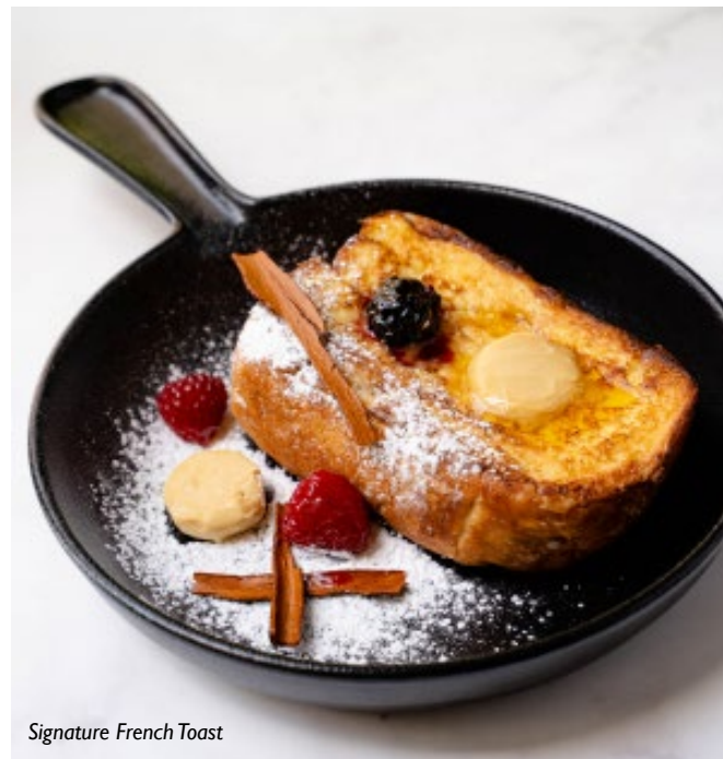
Signature French Toast

Two eggs omelet with two slice of toast, grilled tomato with your choice of 3 fillings: turkey ham, cheese, tomato, onion, mushrooms, pepper CL 595