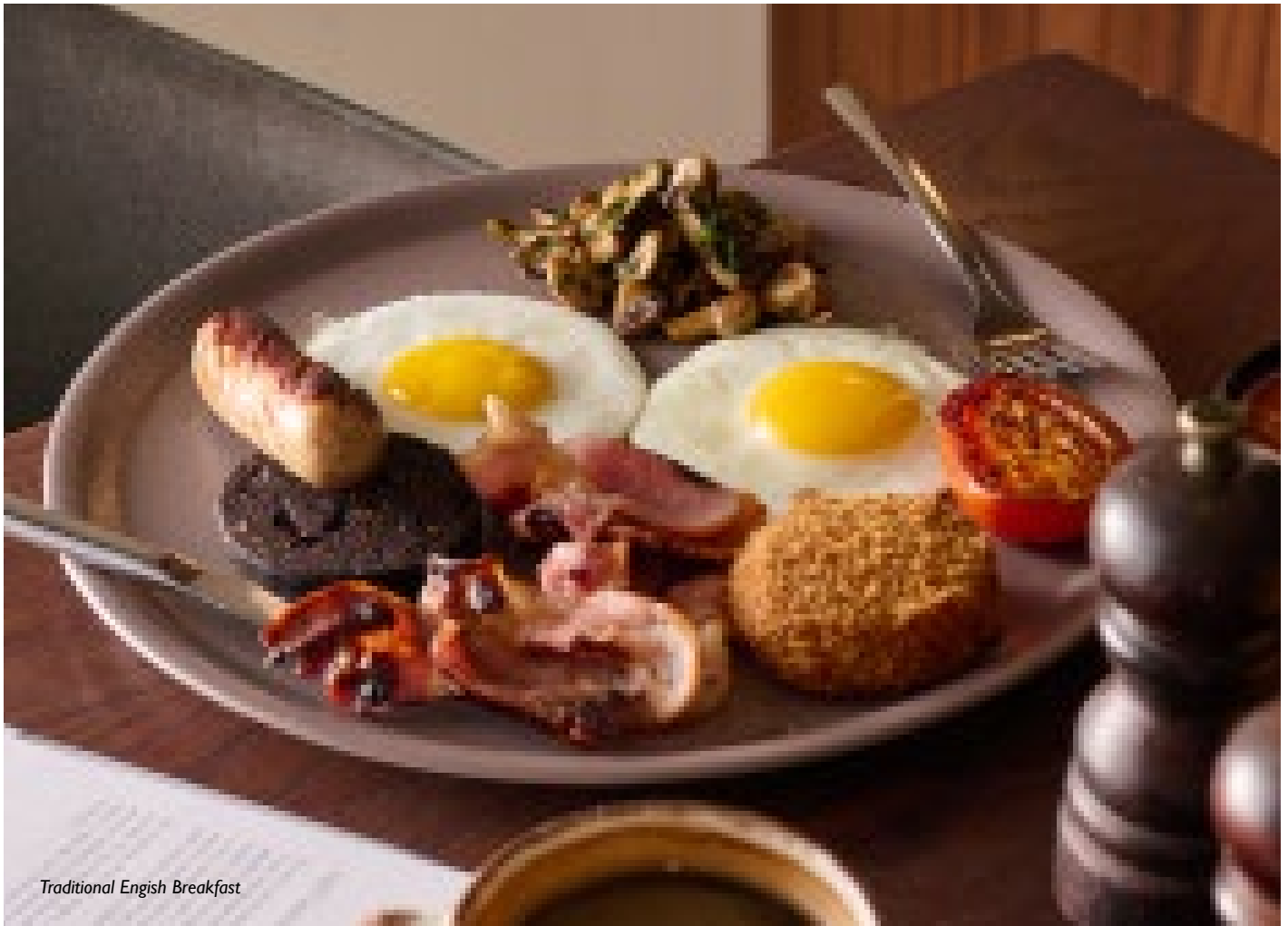
Traditional English Breakfast